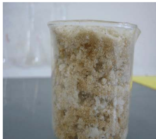
2. Ion Exchange Resin Solidification (Table V, No. 5-1)