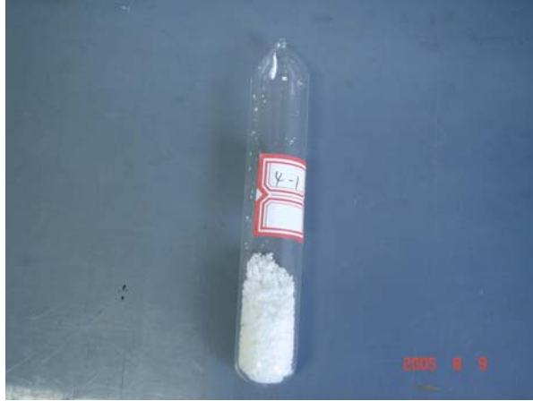
Fig. 3. Vacuum Pump Oil before Irradiation (Table IV. No. 4-1)