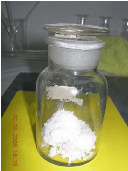
Fig. 1. TBP/OK Solution (Table I, No. 1-1)