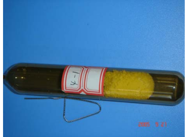
Fig. 4. Vacuum Pump Oil after Irradiation (Table IV. No. 4-1)

Included in the irradiation tests were the two polymers, N910 and N960 (No. 6 and No. 7) in Table VIII. Polymers are checked before and after irradiation. A spectra-graph analysis confirms that the polymers are stable products to use in the irradiation tests.