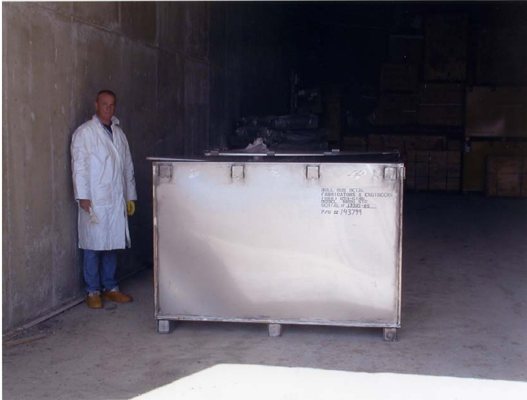
Picture 3: Final Packaging of Solidified Coolant Oil in Stainless Steel B-25 Box